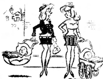
Alf works at the Hovercraft factory.

In my opinion, the roof should be taken off and rebuilt. Floors, where defective, should be taken up and repaired, extra windows to be put in front two rooms and drainage attended to. The work should be undertaken without any delay whatsoever. I think it would pay the Council to obtain the advice of a white-ant expert to advise as to the best means to adopt to prevent a recurrence of the trouble".